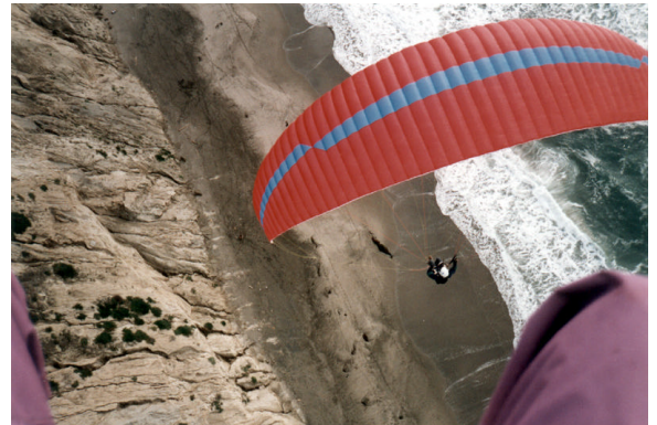
The Octane !